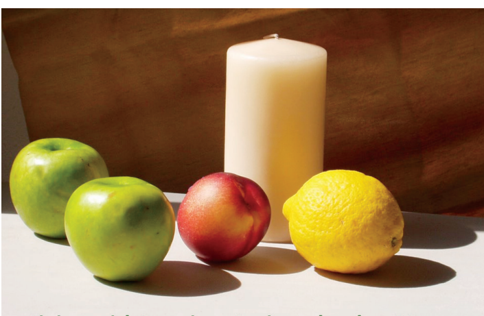
Living with Less in a Society that has More

Date: Tuesday evening, February 22, 2022 Time: 8:00-9:30 pm ET; 7:00-8:30 pm CT; 6:00-7:30 pm MT; via Zoom